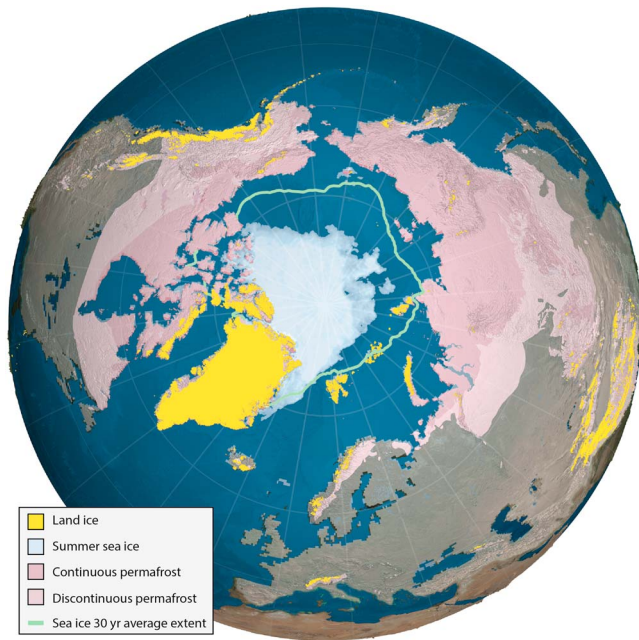
Figure 1. Land ice, summer sea ice, and permafrost in the Northern Hemisphere. Image modified from National Aeronautics and Space Administration/Goddard Space Flight Center Scientific Visualization Studio ( https://svs.gsfc.nasa.gov/3885 ).

2017). The impact of permafrost thaw goes beyond the Arctic because the large amount of biomass carbon contained in permafrost is beginning to decompose and release carbon dioxide and methane to the atmosphere (Schuur et al., 2008). These added greenhouse gases further heat the atmosphere, setting up a self-reinforcing cycle, or feedback, of thawing and heating. Data analyses of permafrost soils up to 3-m depth estimate the potential carbon pool to be as much as 1,035 \pm 150 Pg (1 Pg = 1 Gt; Hugelius et al., 2014; Schuur et al., 2015), with another 425–565 Pg C contained in permafrost deeper than 3 m (Strauss et al., 2017). This pool is climate sensitive and large; soils in all other biomes combined are thought to comprise \sim 2,050 Pg C in the top 3 m. The total permafrost carbon pool (1,460–1,600 Pg C) contains about twice as much carbon as the Earth's current atmosphere (Schuur et al., 2018). A release of 10% of the permafrost carbon pool as carbon dioxide and methane would be of similar magnitude as emissions from land use change (currently 1.3 \pm 0.7 Pg C/year) thereby providing a substantial contribution to future greenhouse gas release (Le Quéré et al., 2018).