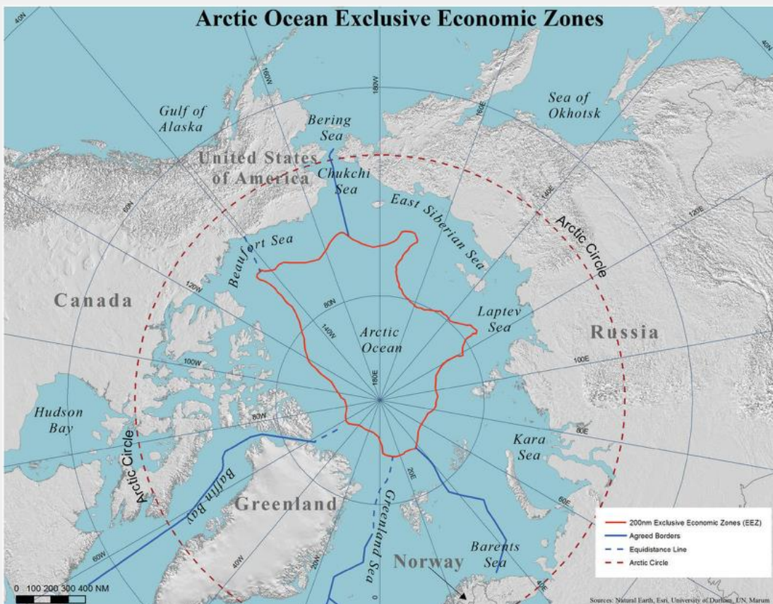
Figure 3 Each state has an exclusive economic zone (EEZ) extending from its baseline to two hundred nautical miles, where coastal states may exercise sovereign rights to explore, exploit, conserve and manage the living resources in the exclusive economic zone, as established within the United Nations Convention on the Law of the Sea.

Despite these challenges, Arctic states are cooperating on some issues relating to maritime traffic. Entering into force in 2013, the Search and Rescue Treaty, ratified by the Arctic states, coordinates search and rescue (SAR) coverage and establishes each state's area of SAR responsibility. Moreover, the International Maritime Organization's Polar Code specifies design,